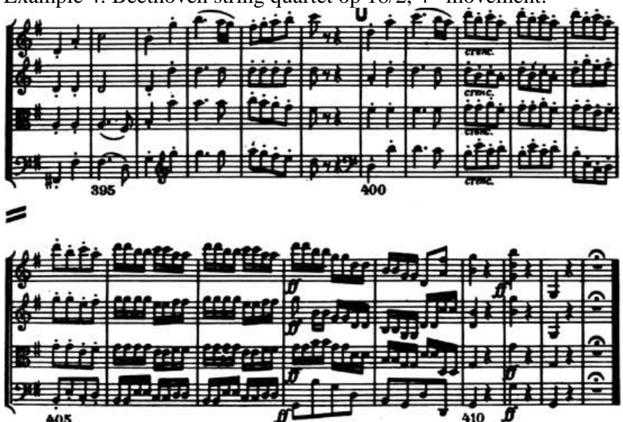
Example 4: Beethoven string quartet op 18/2, 4<sup>th</sup> movement:

10) The same phenomenon occurs in the two symphonies and the other works mentioned above.